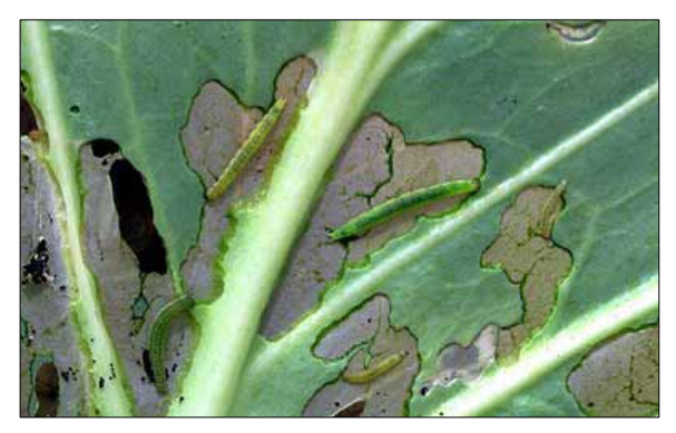
Damage caused by larvae of Diamondback moth